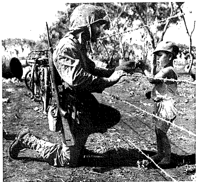
US Marine and child in an internment camp, Tinian